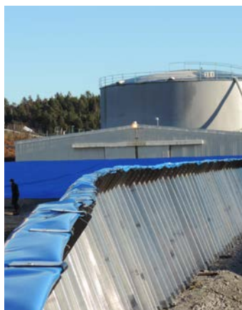
The double folded membrane is fixed with the clips. After clipping, fold down the edge and fix the membrane to the ground.