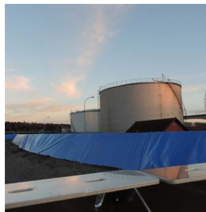
Photo shows the barrier H180 from the water side.